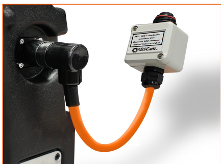
Attached to the CCU