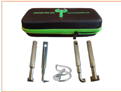
Accessory Case and Tips