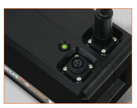
Connectors and LED status lights