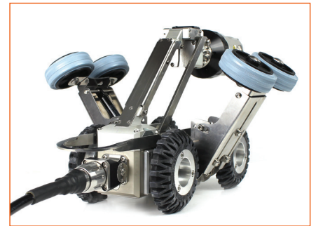
Attached to Crawler