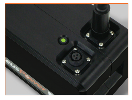
Connectors and LED status lights

Optional arry-bag ideal for storage of the battery pack. The easy access and velcro fasteners keep the battery secure while in use. The bag has an adjustable carry strap.