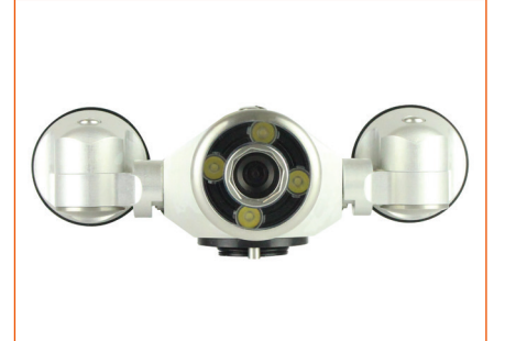
Rear View Optional back-eye camera to capture images from behind the crawler.

most dangerour situations without compromising any features of regular LED Pods.